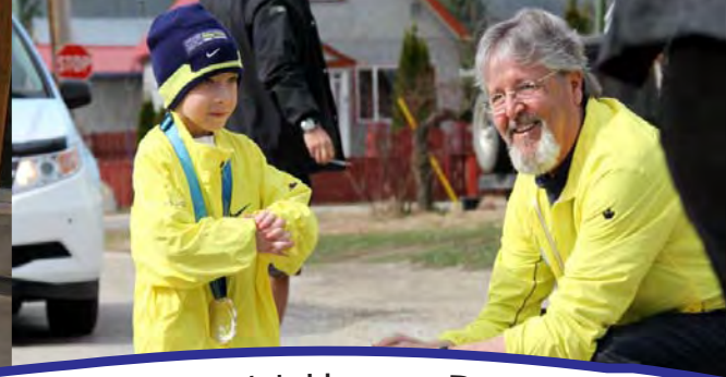
Rick Hansen Relay