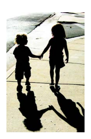
The story of child poverty is very much a story of low wages. The vast majority of BC's poor children live in families with some paid work. And in 2011 (the last year for which we have data), one-third lived in families where at least one adult had a full-time, year-round job.

The living wage calculation is based on the needs of two-parent families with young children, but would also support a family throughout the life cycle so that young adults are not discouraged from having children and older workers have some extra income as they age. In most communities, the living wage is enough for a single parent with one child to get by as well, and this was the case in Metro Vancouver until the 2012 living wage update. Importantly, however, the living wage since 2012 is no longer sufficient for a single parent with one child in Metro Vancouver. The problem is