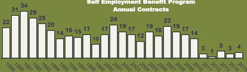
Self Employment Benefit Program Annual Contracts