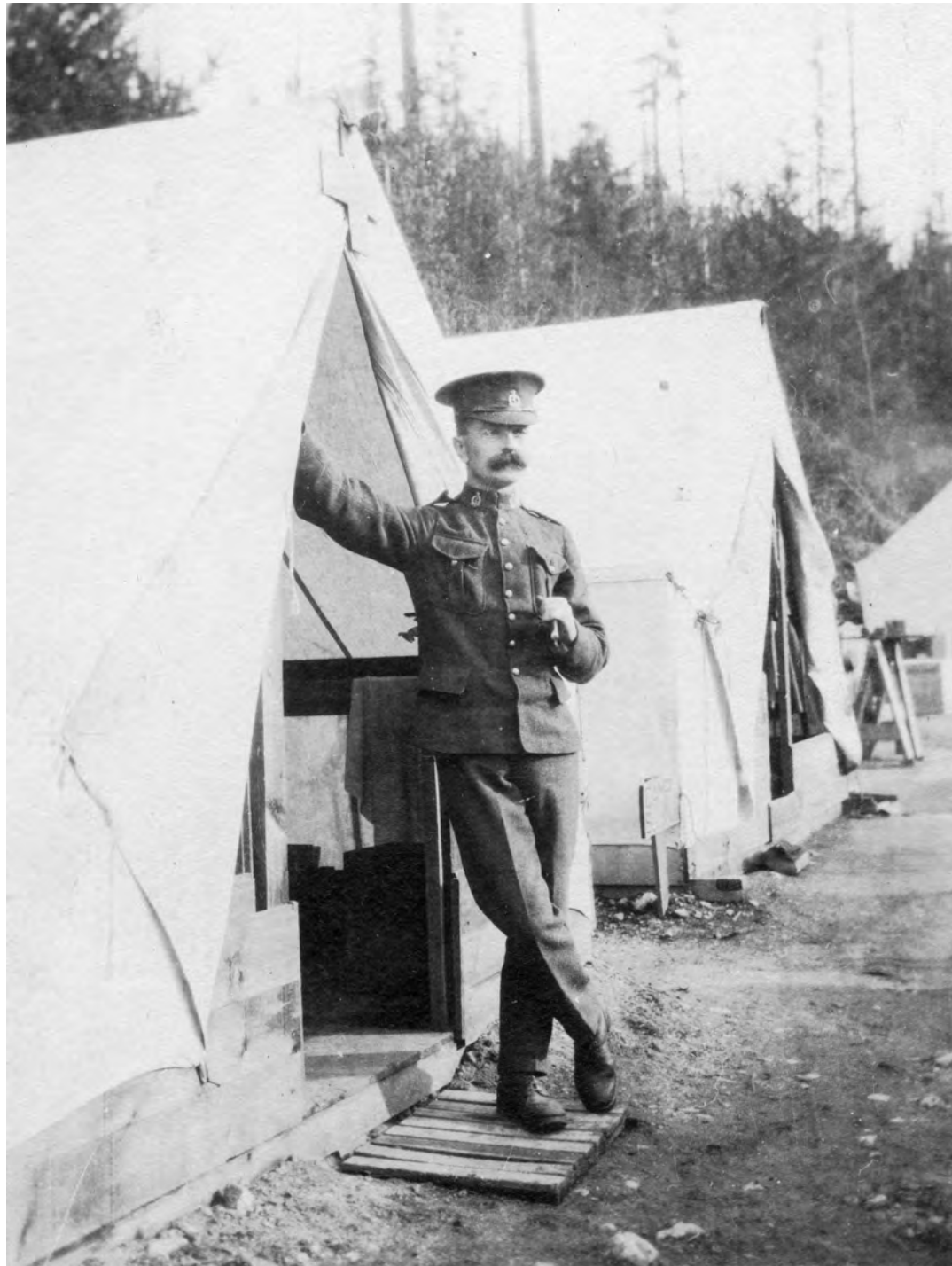
Guard at Mount Revelstoke Internment Camp